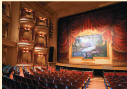
Theaters often apply revenue management by charging more for seats with better views and during times when demand is higher.

Segmented pricing and yield management aren't really new ideas. For instance, Marriott Corporation used seat-of-the-pants yield-management approaches long before it installed its current sophisticated system. Back when J. W. "Bill" Marriott was a young man working at the family's first hotel, the Twin Bridges in Washington, DC, he sold rooms from a drive-up window. As Bill tells it, the hotel charged a flat rate for a single occupant, with an extra charge for each additional person staying in the room. When room availability got tight on some nights, Bill would lean out the drive-up